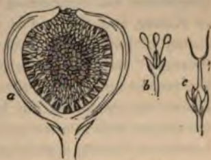
Fig. 14. SECTION OF FIG.

It only remains for us to sum up the results and general conclusions to which our brief study of the science of likenesses may be said legitimately to lead us. Turning firstly to the features we have just been discussing, we have noted, for instance, that the leaf was the type of the whole plant, and that as the leaf became modified to form the "flower," so that flower and its parts, still representing leaves, became further altered to form the "fruit" under all